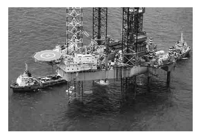
Figure 2 — General view of the offshore oil platform, which used steel piles with aluminum coatings

We have investigated the corrosion protection of Al coating before and after anodic oxidation with the test for immersion in seawater. The mechanisms of corrosion resistance of Al and anodic oxide layers in seawater were also investigated. The results show that the thickness of Al coating is about 300 \mu m by arc spraying, the sample surfaces become loose after seawater immersion corrosion and Cl- and O<sub>2</sub>penetrate into the substrate from the cracks, destroying the binding properties of coating–substrate, and the coating fails. After anodic oxidation, the oxide layer is formed in the surface of Al coating with the thickness